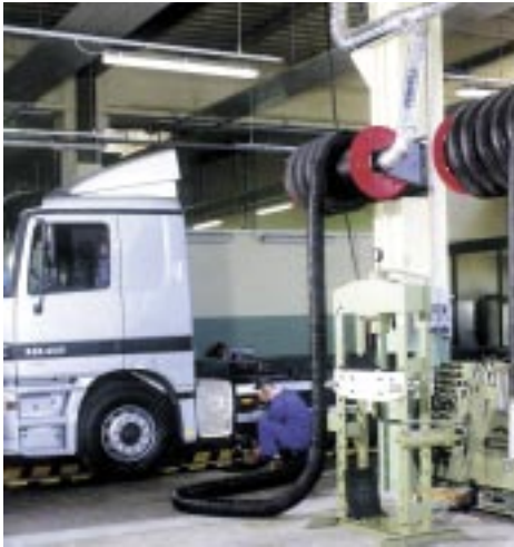
AP/1 and AP/2 Wall-mounted Systems