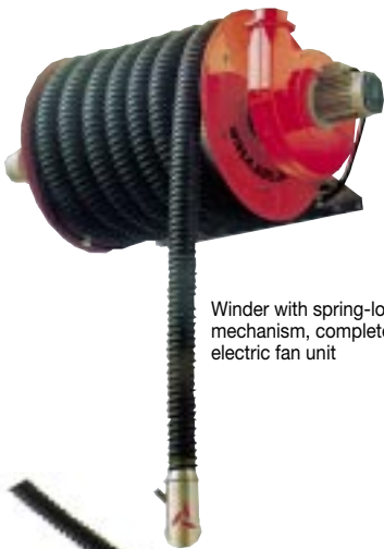
Winder with spring-loaded mechanism, complete with electric fan unit