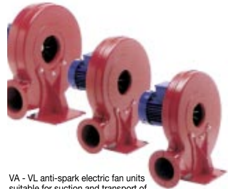
VA - VL anti-spark electric fan units suitable for suction and transport of high temperature gases