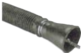
BGs rubber nozzle exhaust gas

BGD rubber nozzle exhaust gas for double silencers