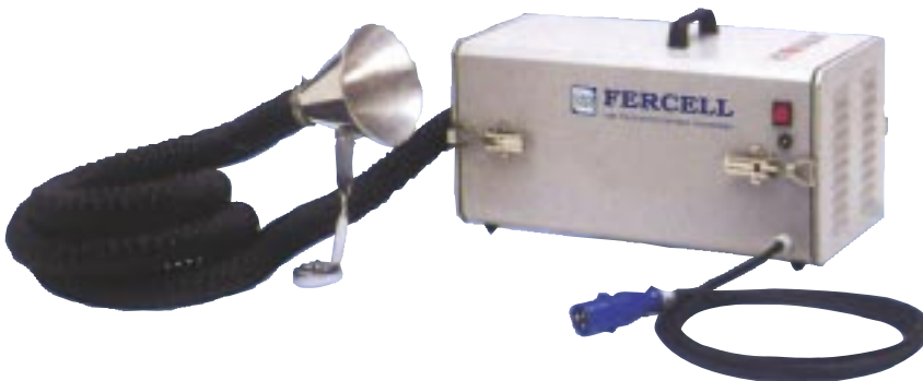
AER 101 portable mechanical purifier

Due to the continued improvement of our products, specifications may vary from those provided in this leaflet. We reserve the right to alter specifications and dimensions without prior notice. Any non standard sizes manufactured to specific requirements. All dimensions quoted are approximate.