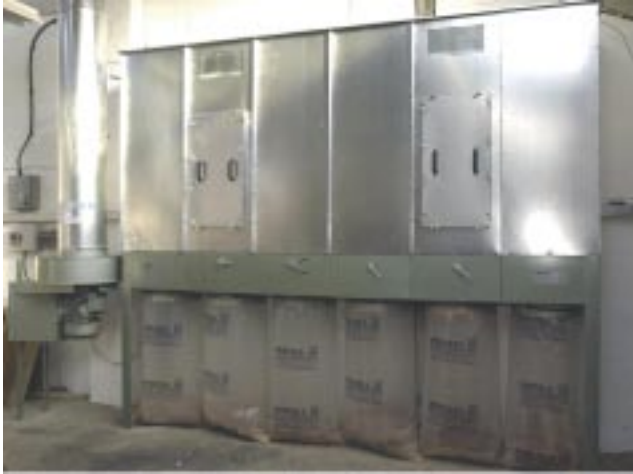
SIL 6 – Enclosed unit with 11 kW fan set and 6 collection sacks

The Ferrell SIL Range of multi breather filter units are all manufactured in heavy gauge formed sheet steel.