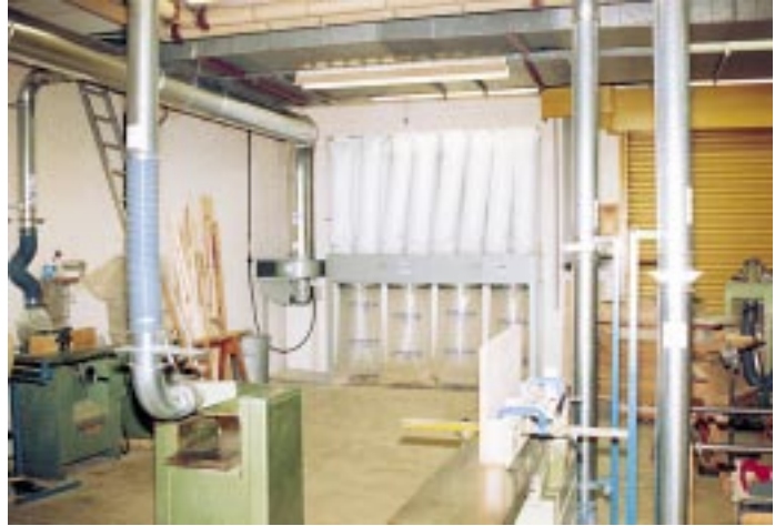
SIL 4 – 5.5 kW open filters with 4 collection sacks, automatic filter cleaning