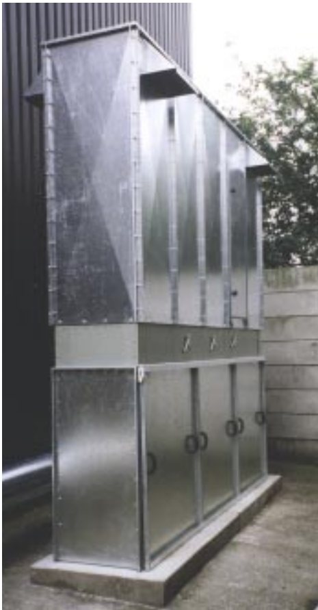
SIL 5 – 7.5 kW fan set with 5 collection sacks enclosed filters, automatic filter cleaning