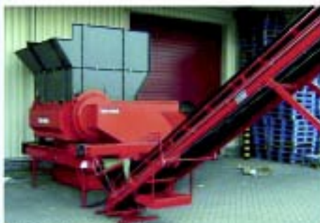
WL6S with conveyor belt