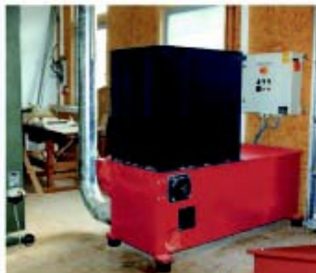
WL4 series shredder, connected to an extraction system

WL4 and WL4S shred all types of timber waste. The patented V-rotor is available in two different diameters depending on customer applications.