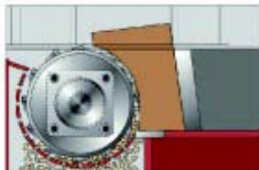
368mm diameter rotor with for big blocks and pieces with larger screen surfaces for an extra high output.