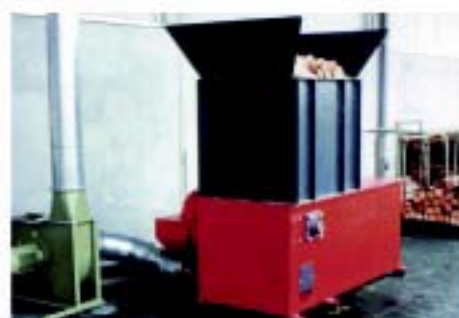
WL6 series shredder with a connected extraction system